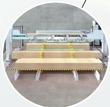
Timber pack storage