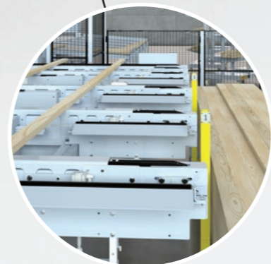
Bow flipping & double stacking devices