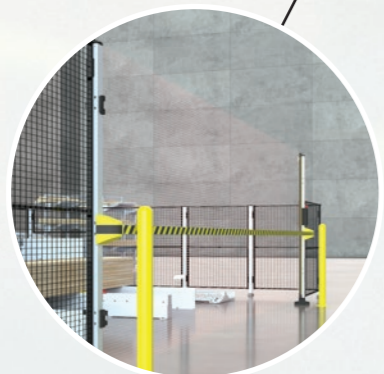
Safety light curtains