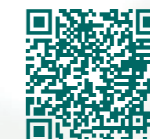
Scan for more information