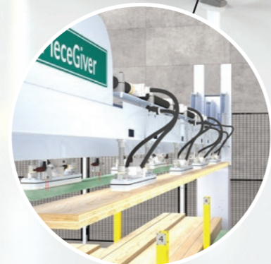
10-second picking cycle time from first pack to deck