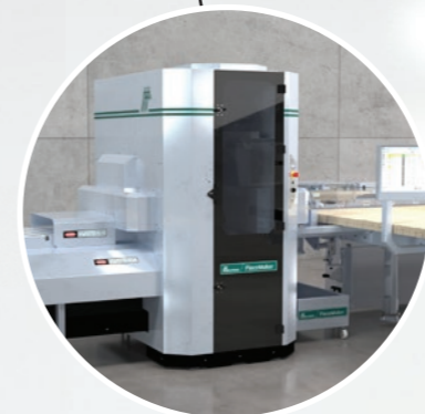
Retrofittable to any PieceMaker saw